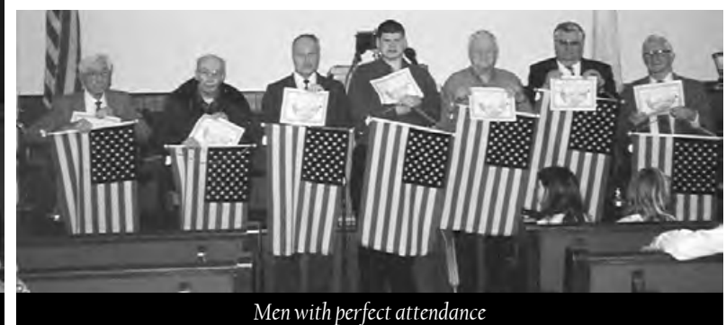
Men with perfect attendance