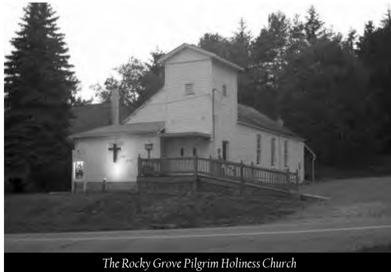
The Rocky Grove Pilgrim Holiness Church