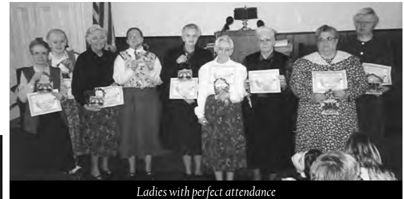
Ladies with perfect attendance