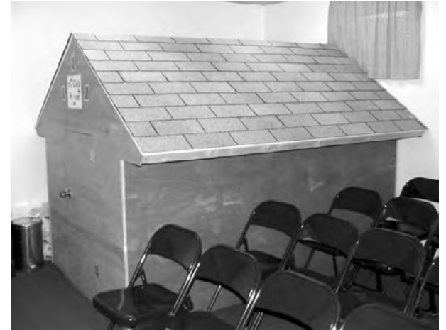
Junior Church Clubhouse

Junior Church attendance ranges from 25 to 67 children and young people each Sunday. In November 2001, the Endicott Church purchased the duplex house next to the parsonage at 1705 Riverview. Since then, new blacktop was put on the driveway and the parking area in back of the house. One side of the house is currently used for a fellowship hall and meeting place. The upstairs is used for guest quarters. In 2004, the parsonage roof was replaced by Dennis Symons and sons from Greene, NY. The Endicott Church continues to reach souls in the triple cities area. Please continue to pray for the Endicott Church as we endeavor to win the lost for Jesus' sake.