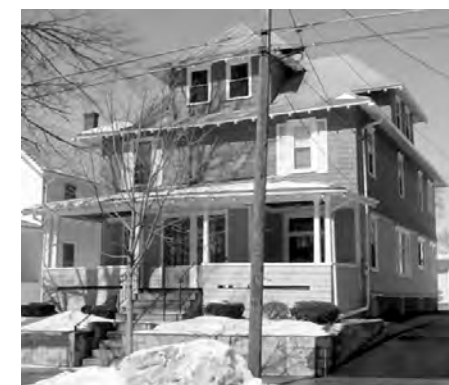
1705 Riverview Drive property