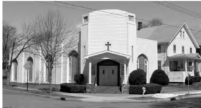
Pilgrim Holiness Church in Endicott, NY