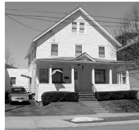
Endicott Church Parsonage